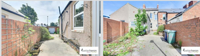
Town garden to the front. Low maintenance courtyard to the rear with shutter door providing off street parking.