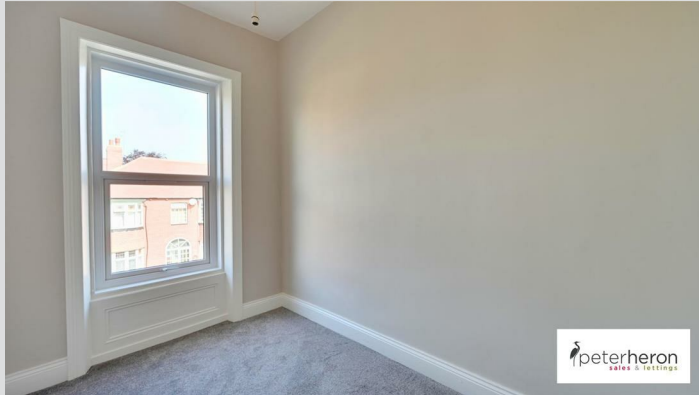
Double glazed window to front and radiator.